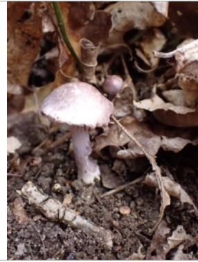
Inocybe lilacina /Lilac Fibrecap