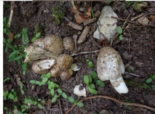
Coprinopsis atramentaria /Common Inkcap