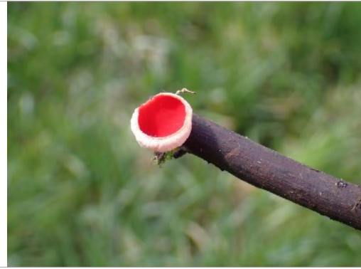
Sarcoscypha austriaca /Scarlet Elfcup