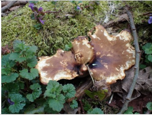
Polyporus badius /Bay Polypore