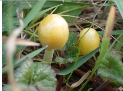
Bolbitius titubans /Yellow Fieldcap